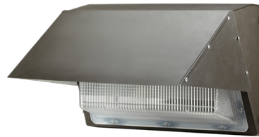
DLC Listed Reflector